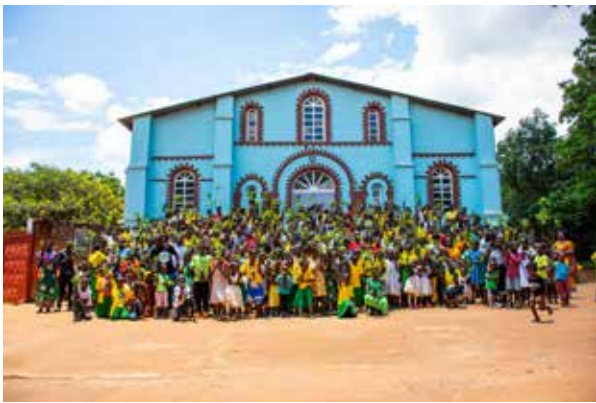
Likuni Parish (Likuni Deanery)