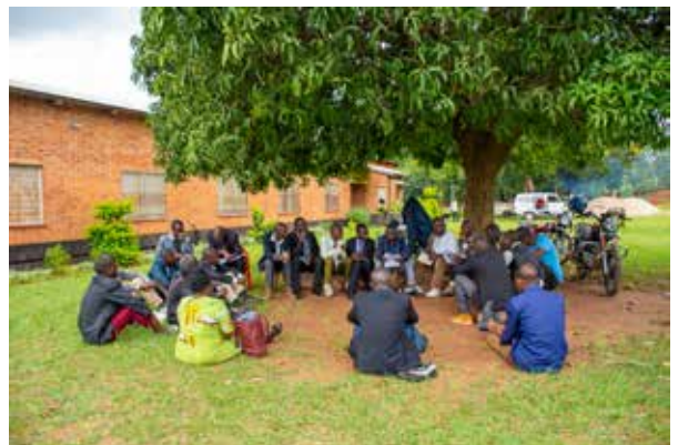
St. Pauls Parish (Mchinji Deanery)