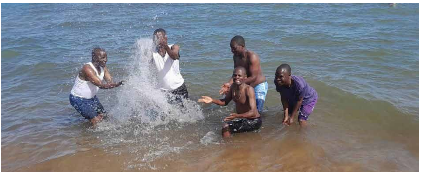
Visitors enjoying the fresh waters of Lake Malawi at St. Francis Cottage