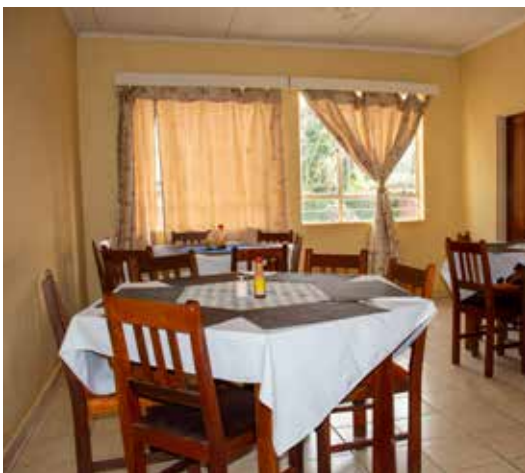
Enjoy delicious meals in our welcoming dining area