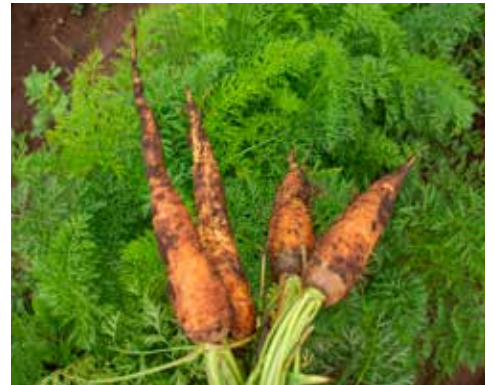
Sweet and crunchy carrots, grown in rich soil.