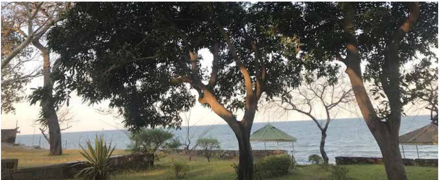
Established view of Lake Malawi at St. Francis Cottage