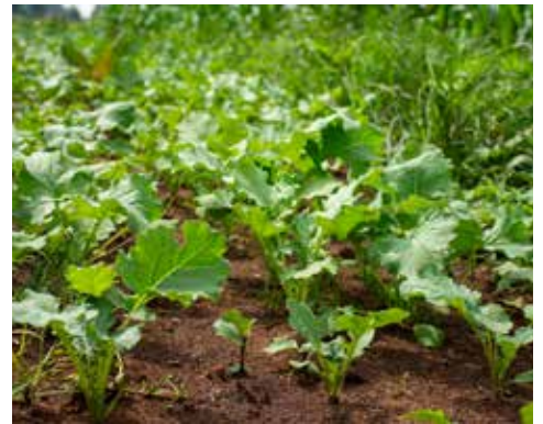
Crisp lettuce and flavorful Rape, grown with care for optimal freshness and providing essential vitamins and minerals.