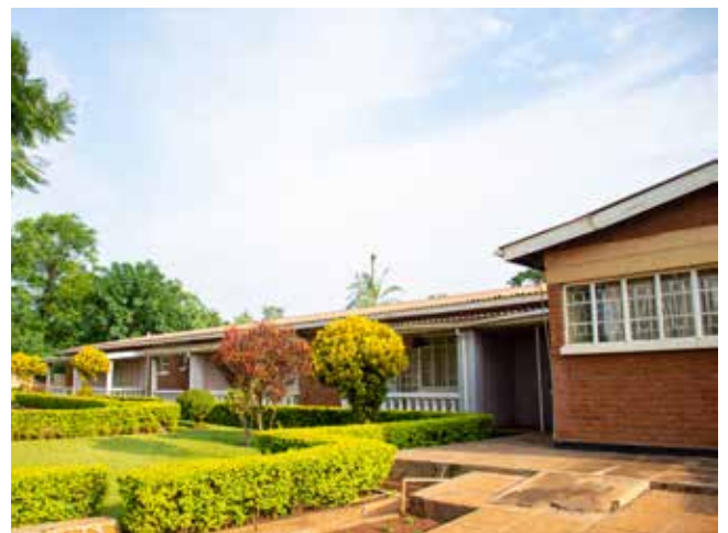
Relax and unwind in our peaceful gardens.