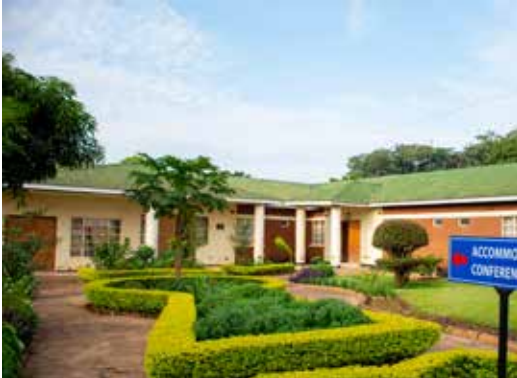
Experience the best hospitality services at Msamba Catholic Centre.

Msamba Catholic Centre, in Area 36, Lilongwe, Malawi, offers affordable accommodation, meals, and conference facilities in a peaceful and secure setting, just before Msamba Parish.