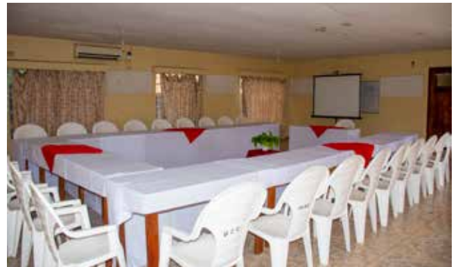
Creating the perfect environment for collaboration and innovation