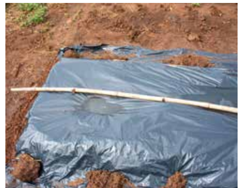
A gardener's trick: black paper to give tomato seedlings a head start, alternative to green house effect.