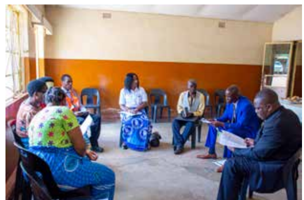
Mtima Woyera Parish (Mtima Woyera Deanery)