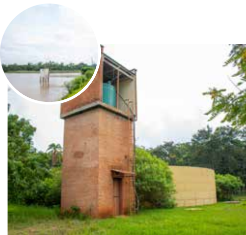
In Malawi's climate, this water reservoir is crucial for sustainable agriculture at Mlale Farm.