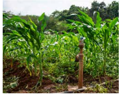
Cultivating maize, a staple crop, to support local food security