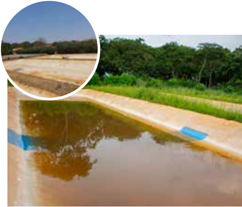
Our fish ponds offer a sustainable source of fresh seafood, diversifying our agricultural portfolio

22 acres of land dedicated for cultivating both livestock and crops for a thriving community.