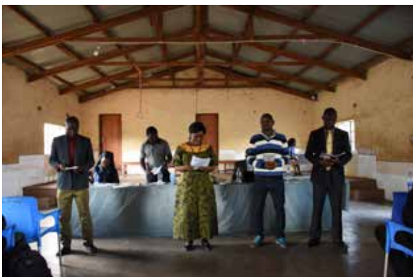
Mponela Parish Hall (Dowa Deanery)