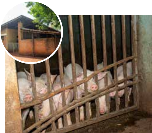
Pig farming is a key component of Mlale Farm's livestock operations