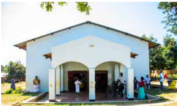
Dwangwa Church (Salima Deanery)